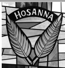
Palm Sunday March 24, 10:30 a.m. Sanctuary & Livestream