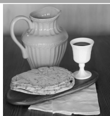
Maundy Thursday March 28, 6:00 p.m. Fellowship Hall