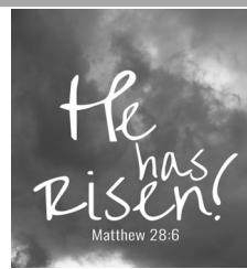
Easter Sunday April 9, 10:30 a.m. Sanctuary & Livestream