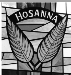
Palm Sunday April 2, 10:30 a.m. Sanctuary & Livestream