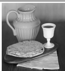
Maundy Thursday April 6, 6:00 p.m. Fellowship Hall